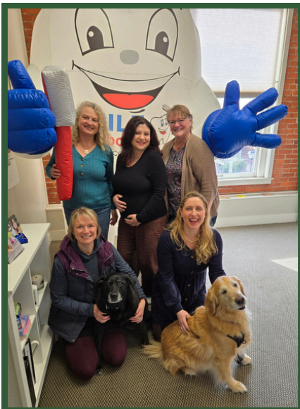
First 5 took a simply delightful picture with Molarie and their furry, four-legged pals.

In total, we connected with 189 attendees, providing hands-on learning, helpful oral health supplies and plenty of smiles along the way. From interactive activities to storytelling to simple tips kids can use every day, these events helped build confidence and excitement around taking care of their teeth.