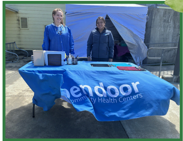
Rain or shine or even blustery weather can't stop the Open Door Dental Team!

On May 15, Smile Humboldt, First 5 Humboldt and the Open Door dental team held our second annual Blooming Smiles Playdate. We are happy to report that it was a resounding success! We got the dental party going at the Jefferson Community Center and Park from 8 a.m.-12:30 p.m. The event catered to families with children between the ages of 0 to 6, who were provided oral health screenings by Open Door's dental team. The children screened were also able to establish a dental home at Burre Dental Center for future care.